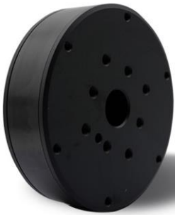
Weight : 650g approx.