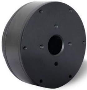
Weight : 185g approx.